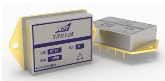
SVRMH Series EMI Filter