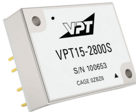
Figure 2. All metal package simplifies EMI compliance.

A six-sided metal package provides ruggedness and effective EMI shielding. The metal lid and baseplate are mechanically and electrically connected to each other and to the internal PCB. Internal common mode capacitors provide a return path for radiated and common mode noise, reducing radiated emissions and susceptibility, and greatly simplifying EMI compliance.