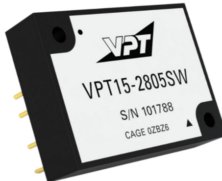
Figure 3. Epoxy Encapsulated V-Shield® packaging.

A six-sided metal package provides ruggedness and effective EMI shielding. The metal lid and baseplate are mechanically and electrically connected to each other and to the internal PCB. Internal common mode capacitors provide a return path for radiated and common mode noise, reducing radiated emissions and susceptibility, and greatly simplifying EMI compliance.